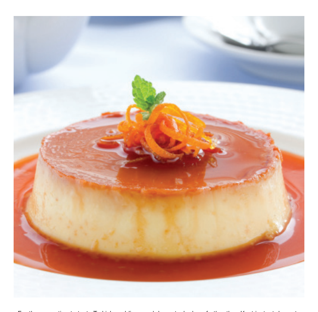
For those wanting to taste Turkish puddings and desserts, look no further than Kent instant desserts that are convenient and easy to prepare. Also available are Kent instant whipped creams, jellies and baking condiments.